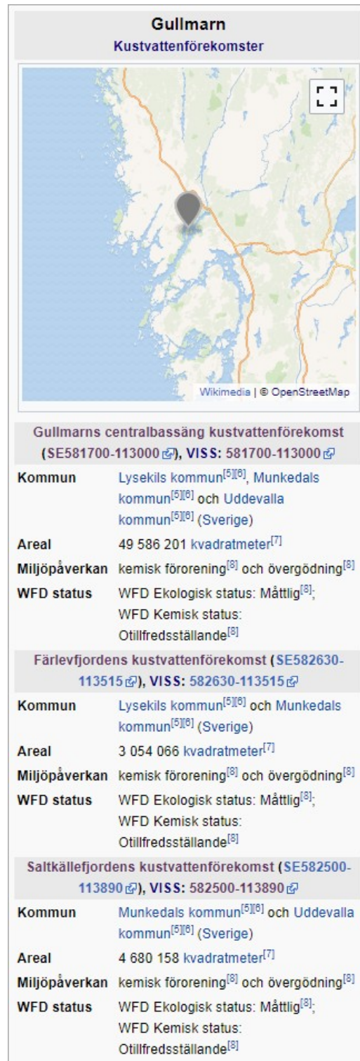
Figure 3. The infobox for coastal water bodies developed during this project implemented for Gullmarn centralbassäng coastal water body. The infobox features spatial information describing the coastal water bodies such as municipalities and surface area. The ecological and chemical status classification is listed along with significant environmental impacts according to the WFD Swedish